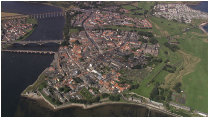
Berwick, on the English/Scottish border.