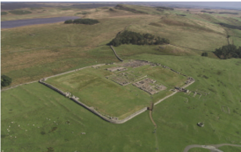
Housesteads is perhaps the best preserved fort on the Wall.