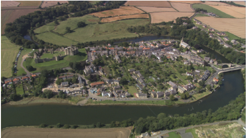
The town of Warkworth is virtually surrounded by the River Coquet.