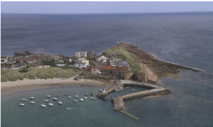
The little fishing village of Beadnell.